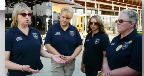
Port Police Recruiting