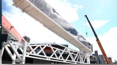
Cruise & Terminal Improvements